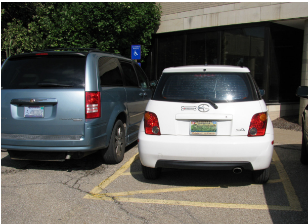
Access aisles are not intended for emergency parking.

Or, if a person with a disability returns to the vehicle and finds a car parked over the access aisle, the person may have to wait hours until the violator moves the illegally parked vehicle.