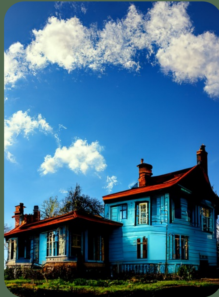
Peer Run Respite